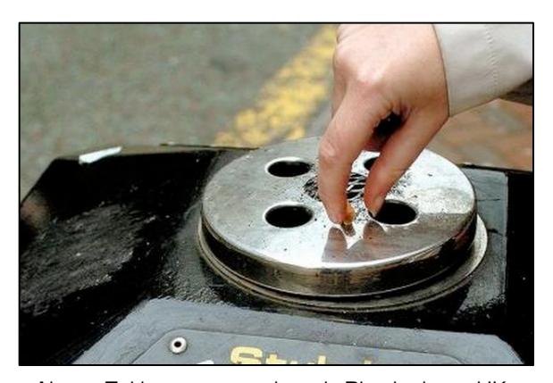
Above: Taking a get-tough tack, Birmingham, UK has upped its fines for cigarette butt littering and has ended its early payment discounts. Council appears determined to change the culture and perception of smokers who litter.

A Jefferson Salamander (left), hurt by people who litter and dump. A Kitchener woman sparked action. See story, left.