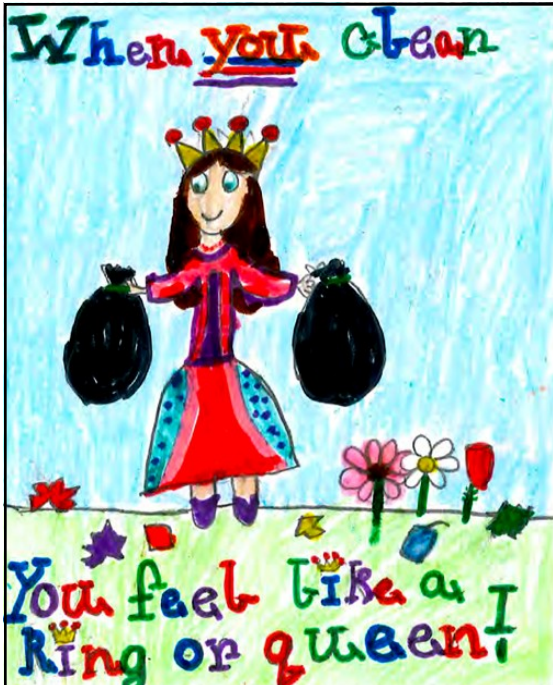
Top prize: A t-shirt, $100 for classroom supplies and a pizza party for the class with the Mayor of Rochester.