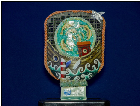
Above, one of the Ocean Awards trophies using pieces of beach litter as raw material.