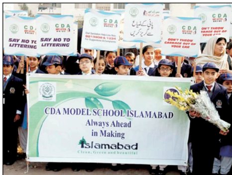
Photo, right: Students from CDA Model School in Islamabad, Pakistan rally for tidiness. "Say No To Littering," their signs say.

Summer's litter crackdown in Victoria, one of the world's least littered cities, coincides with the launch of a popular, new digital reporting centre app compatible with all mobile devices. Ads and a digital strategy will run until March. Wangaratta is Victoria's entry, up against Nundle in New South Wales, Mundubbera in Queensland, Sheffield in Tasmania, Kingston SE in South Australia, Walpole in Western Australia, and Titjikala in the Northern Territory, in the national 2013 Keep Australia Beautiful Tidy Towns Competition. Victor Harbour, South Australia won last year.