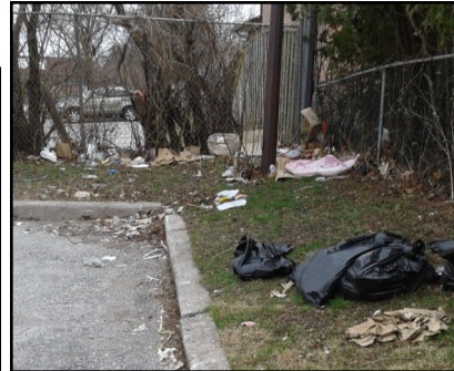
Photo, left: Too close to home. This photo gives lie to the often-quoted statement that "Toronto is a clean city." With the entire city and nation captured by the daily impacts of the novel coronavirus, litter action has fallen to the bottom of the heap as a priority.

Calling all citizen scientists: there's an app out now for feeding real time plastic pollution data to scientists. Earth Challenge 2020, developed by the US State Department, Wilson Center and Earth Day Network, uses technology by the global mapping firm ESRI to aid reporting of sightings.